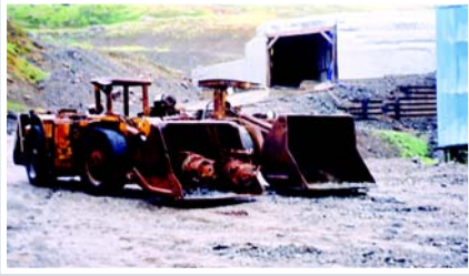
2- Wagner Scoop Trams