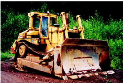
Cat D8L Crawler Tractor

ROLLING STOCK: Cat D8L Crawler Tractor, c/w SS ripper, 7,500 hrs • Cat 235 Longstick Excavator, c/w 7,453 hrs • Cat 966D Wheel Loader, S/N 99Y01829, c/w forks, 7,884 hrs • '89 Kenworth C500B 6x6, S/N 2NKCLBOX7KM922458, p/w Cat 3406, 425 HP, c/w Dell 16 yd box, '89 Atlas AK4006B-72 crane • And More... *Note: Some Rolling Stock will be needed for mine reclamation.