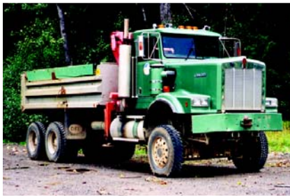
'89 Kenworth C500B 6x6 Dump Truck

VISIT TRADEWESTSALES.COM FOR ALL UPCOMING AUCTIONS & LIQUIDATIONS