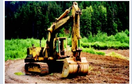
Cat 235 Longstick Excavator