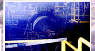
Allis Chalmers 8' x 12' Ball Mill