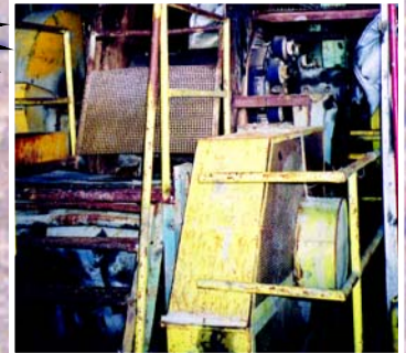
Austin Western 25" x 40" Jaw Crusher

GENSETS: '87 Cat 3516 STD, S/N 73Z00 221, c/w 1615 HP, 1204 KW, Kato Brushless AC Generator • '87 Cat 3516 STD, S/N 73Z00 220, 1322 HP, 986 KW, Kato Brushless AC Generator • '87 Cat 3512 STD, S/N 24Z01 893, 1636 HP, 1220 KW, Kato Revolving Brushless AC Field Generator • Cat 3412 TT, S/N 38S09446, Leroy Somer AC Generator • Cat 3412, S/N 38S5242, Leroy Somer Generator • Simpower LSA 46 M5 , S/N MO35286/1 IP-21 •