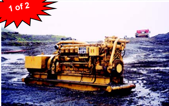
'87 Cat 3516 Genset