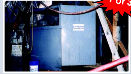
Atlas Copco Rotary Screw Compressor