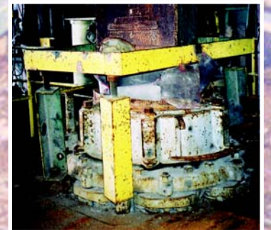
Symons 3 FT Standard Cone Crusher

BALL MILLS: Allis Chalmers 8' x 12' Ball Mill, 350 HP, 600 V, 1770 RPM, c/w starter, liners, feed chute, discharge trommel & oversize return device • Denver 8' x 8' Re grind Ball Mill, 300 HP, c/w pumps, cyclone, electronics •