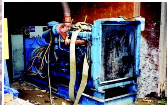
Simpower LSA 46 M5 Genset