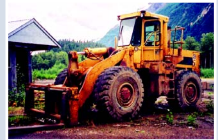
Cat 966D Wheel Loader

VISIT TRADEWESTSALES.COM FOR ALL UPCOMING AUCTIONS & LIQUIDATIONS