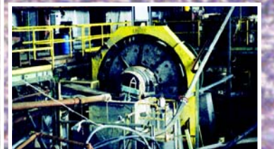
Denver 8' x 8' Re grind