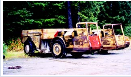
Wagner MT 413-30 Underground Dump Trucks