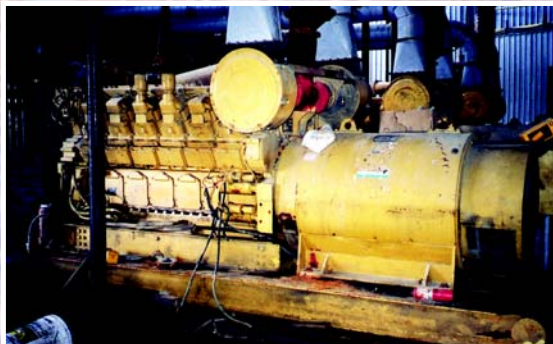
'87 Cat 3512 Genset