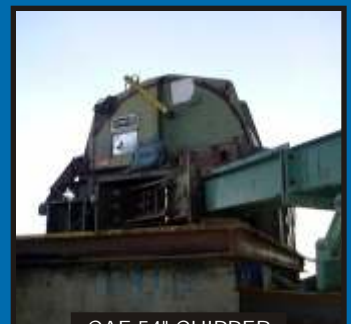
CAE 54" CHIPPER