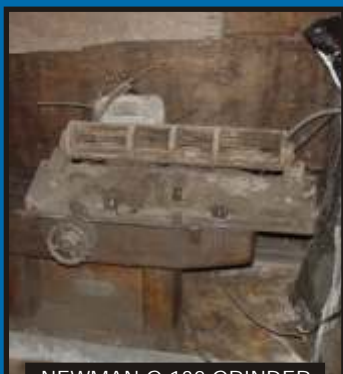
NEWMAN G-132 GRINDER