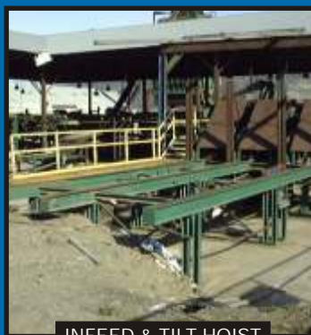
INFEEED & TILT HOIST