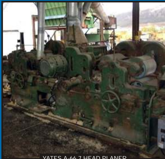
YATES A-66 7 HEAD PLANER