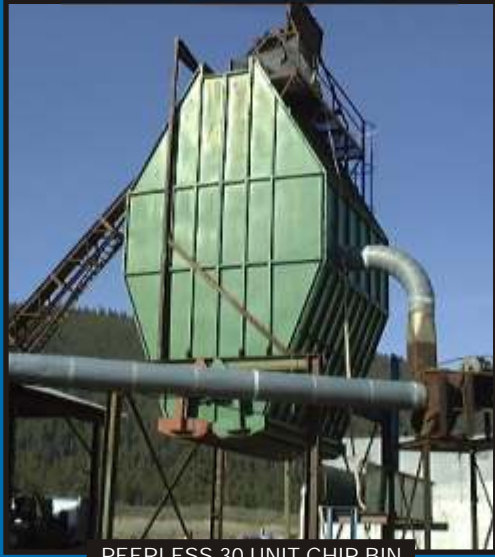
PEERLESS 30 UNIT CHIP BIN