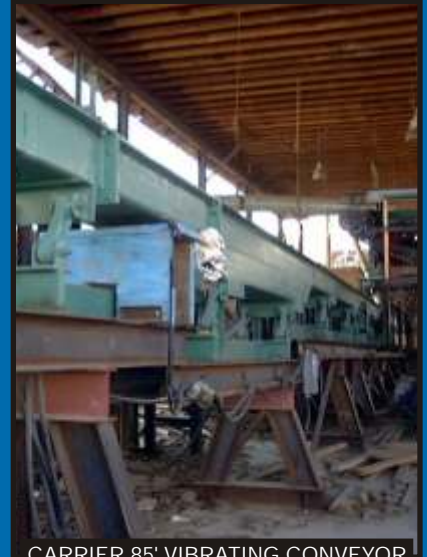
CARRIER 85' VIBRATING CONVEYOR

PLANER LINE: 6 Run Infeed Deck, 15' x 20', WR78 Chain; c/w drive • Yates Double Pineapple Infeed, c/w hurry up roll, hydraulic drive • Yates A66M, 7 Head Motorized Planer; 6" x 15" Capacity; c/w hydraulic feedworks & support unit • 18" x 30' Belt Conveyor, c/w drive • Single Saw Circular Resaw, 6" x 6" cap., 50HP motor, infeed & outfeed belts w/ drives • 30" x 15' Belt Conveyor • 3 Arm Stud Stacker • 2 Arm Tilt Hoist •