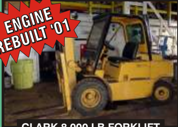
CLARK 8,000 LB FORKLIFT