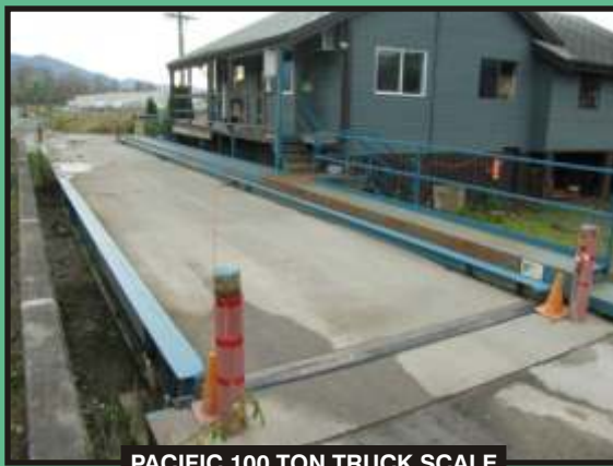
PACIFIC 100 TON TRUCK SCALE