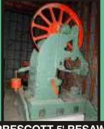
PRESCOTT 5' RESAW