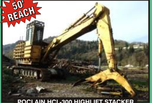
POCLAIN HCL-300 HIGHLIFT STACKER