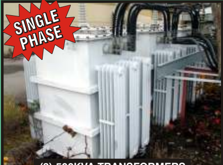
(3) 500KVA TRANSFORMERS