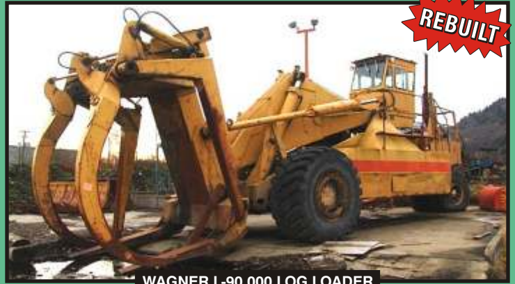
WAGNER L-90,000 LOG LOADER

• SITE PHONE • (604) 702-0260 Site Fax: (604) 702-0261