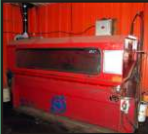
MICHIGAN 72" GRINDER