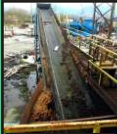
48" X 48" CONVEYOR