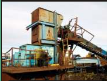
WILLIAMS 48" HAMMER HOG