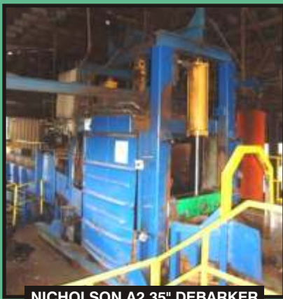
NICHOLSON A2 35" DEBARKER