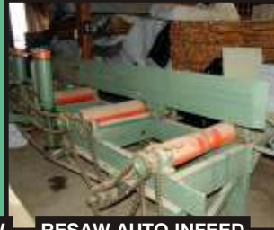
RESAW AUTO INFEED