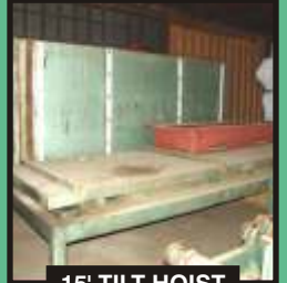
15' TILT HOIST