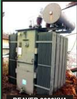
BEAVER 3000KVA TRANSFORMER