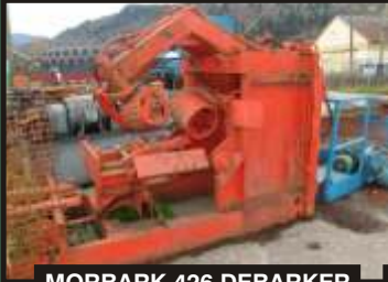
MORBARK 426 DEBARKER