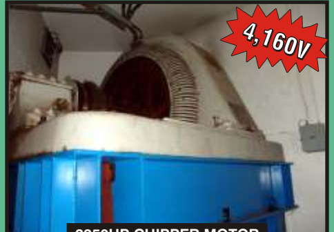
2250HP CHIPPER MOTOR