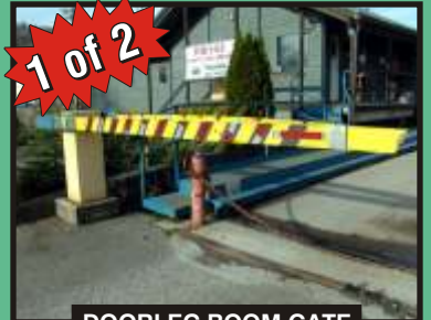
DOORLEC BOOM GATE