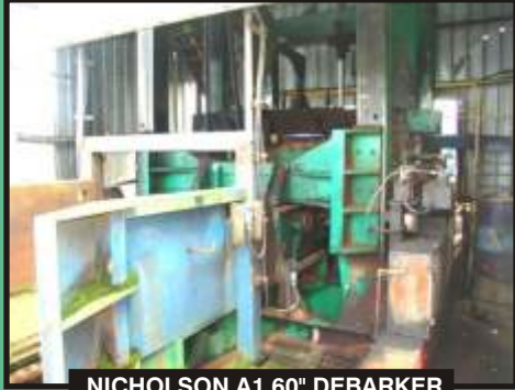
NICHOLSON A1 60" DEBARKER

If you are unable to attend this auction in person, you can bid by way of absentee (proxy) bids, either by phone, fax or email. It's the next best thing to being there yourself! There are pre-registration and deposit requirements for this service. Please contact TRADEWEST for full information.