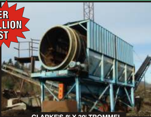
CLARKE'S 8' X 30' TROMMEL