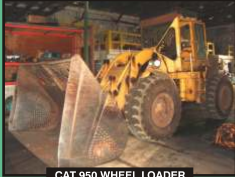
CAT 950 WHEEL LOADER