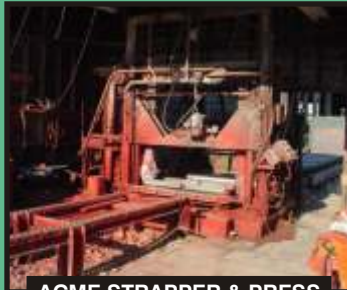
ACME STRAPPER & PRESS