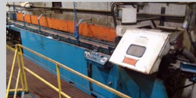
ULTIMIZER 14B22-252 OPTIMIZING SAW