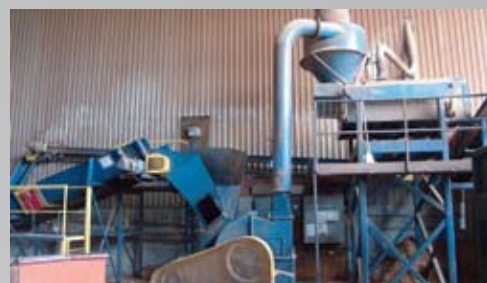
PRECISION CHIP PACK SYSTEM

Listings subject to additions, deletions and prior sales without notice.