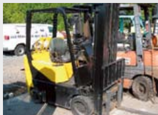
DAIWOO GC18 3,500LB FORKLIFT