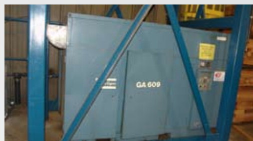
ATLAS COPCO GA609 60HP COMPRESSOR