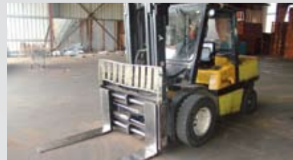
'00 YALE GDO120 12,000LB FORKLIFT