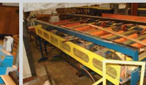
ADVANCE SCISSOR LIFT INFEED ROLL SYSTEM