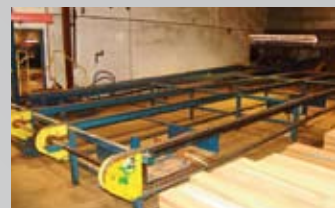
OPTIMIZER GREEN CHAIN