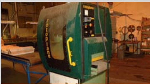
OGDEN ROTOPLANE 16T ROTARY PLANER