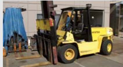
'99 HYSTER H155XL FORKLIFT