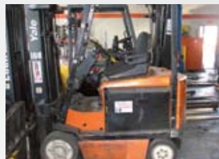
YALE ERC050 5,000LB FORKLIFT