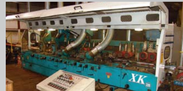
'01 WADKIN XK-220 8 HEAD MOULDER

Preview: Thursday, November 12th • 9 AM - 5 PM