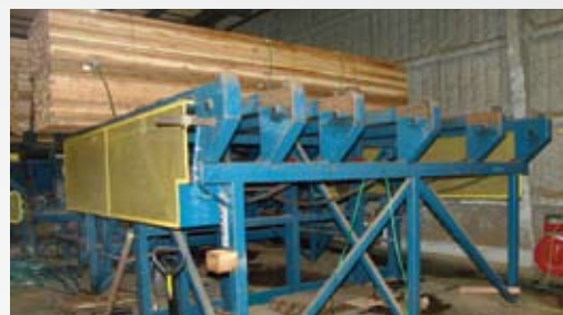
ADVANCE PACKAGE BREAKDOWN