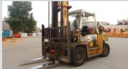
1 OF 2 TCM FD70 15,000LB FORKLIFTS