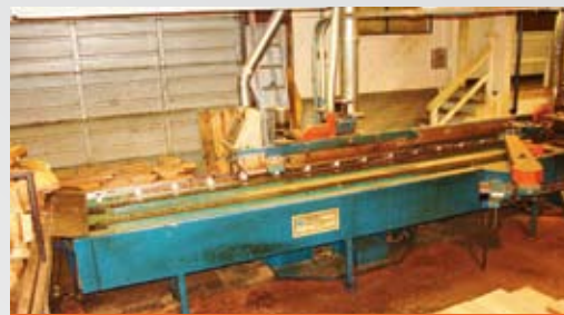
WESTERN MACHINERY FINGER JOINT LINE