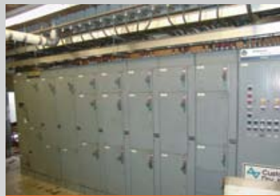
AB 10 BANK MCC