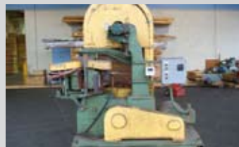
KIMWOOD 30" BAND RESAW