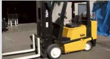
YALE 8,000LB FORKLIFT