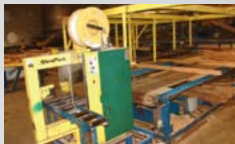
1 OF 2 STRAPACK AUTO STRAPPERS