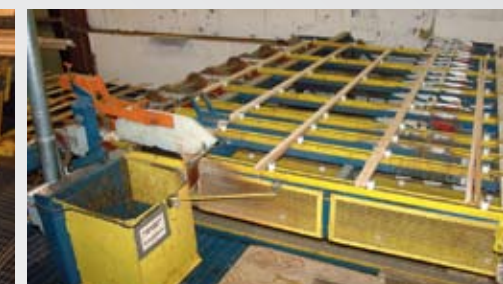
OUTFEED SINGLE END TRIM TABLE