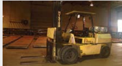
HYSTER H110XL 11,000LB FORKLIFT