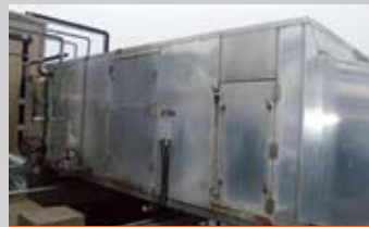
1 OF 6 KILN AIR HANDLERS