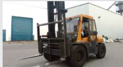
'98 TCM FD-80Z8 18,000LB FORKLIFT