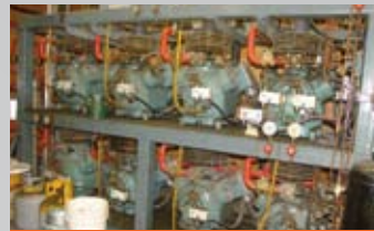
(8) 45HP COMPRESSORS