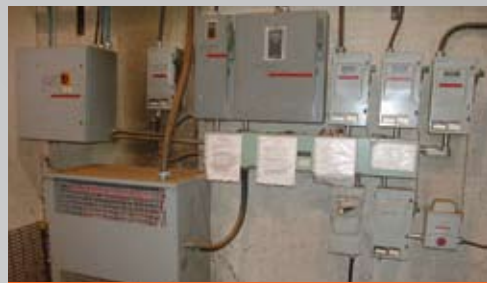
112.5KVA TRANSFORMER & ELECTRICS