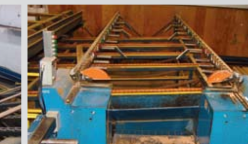
PRECISION 18LH & 18RH CHOP SAWS