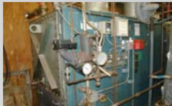
RITE STEAM BOILER, 3,250,000BTU