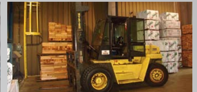
HYSTER H210XL 20,000LB FORKLIFT