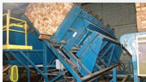
ADVANCE 20' SCISSOR LIFT TILT HOIST