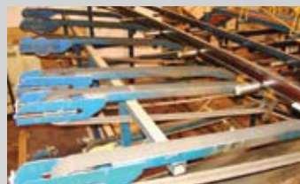
OPTIMIZER INFEED SYSTEM