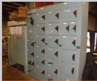
AB 4 SECTION MCC