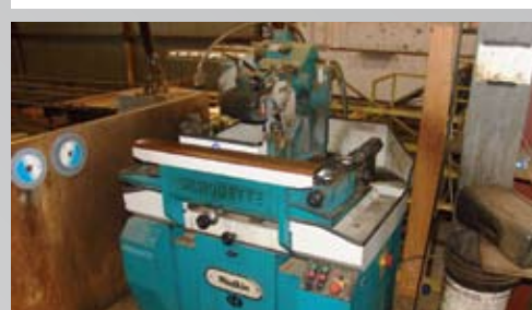
WADKIN SILHOUETTE PROFILE GRINDER