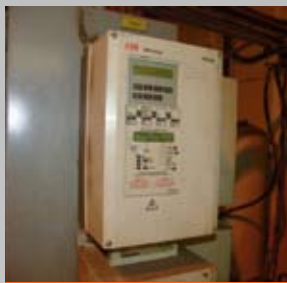
1 OF 4 ABB SOFT STARTS