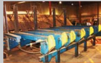
PKG BREAKDOWN & TILT HOIST