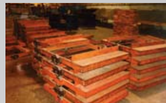
55 LUMBER CARTS