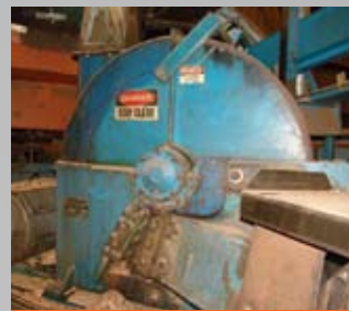
PRECISION 6 KNIFE CHIPPER