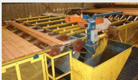
12' X 16' W 8 RUN TRIM TABLE