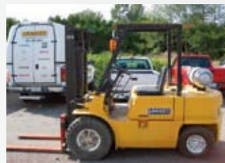
MITSUBISHI FG30 6,000LB FORKLIFT

Listings subject to additions, deletions and prior sales without notice.