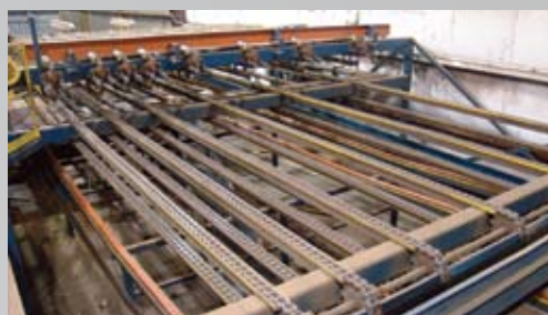
CHOP LINE INFEED TRANSFER