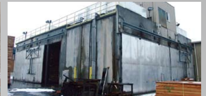
CUSTOM STEAM DEHUMIDIFICATION KILN SYSTEMS