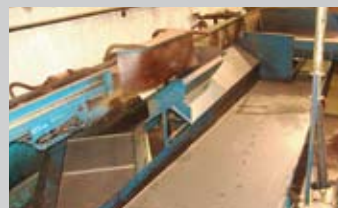
OPTIMIZER OUTFEED SYSTEM