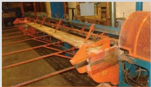
FINGER JOINTER 22' PRESS-TRIMMER