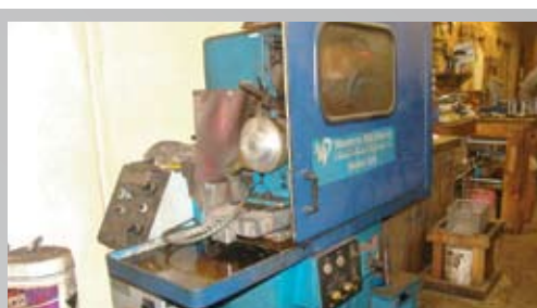
WESTERN 800 FINGER JOINTER HEAD GRINDER