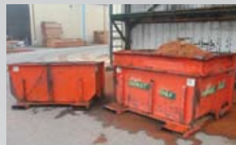
2 OF 8 DUMP BINS