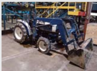
MITSUBISHI YARD TRACTOR