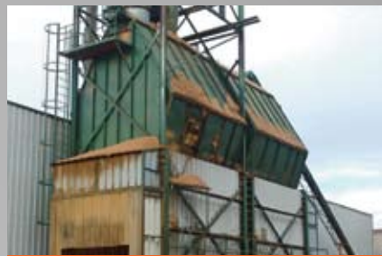
PEERLESS 40 UNIT CHIP & SAWDUST BINS