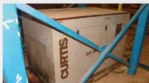
CURTIS 50HP COMPRESSOR